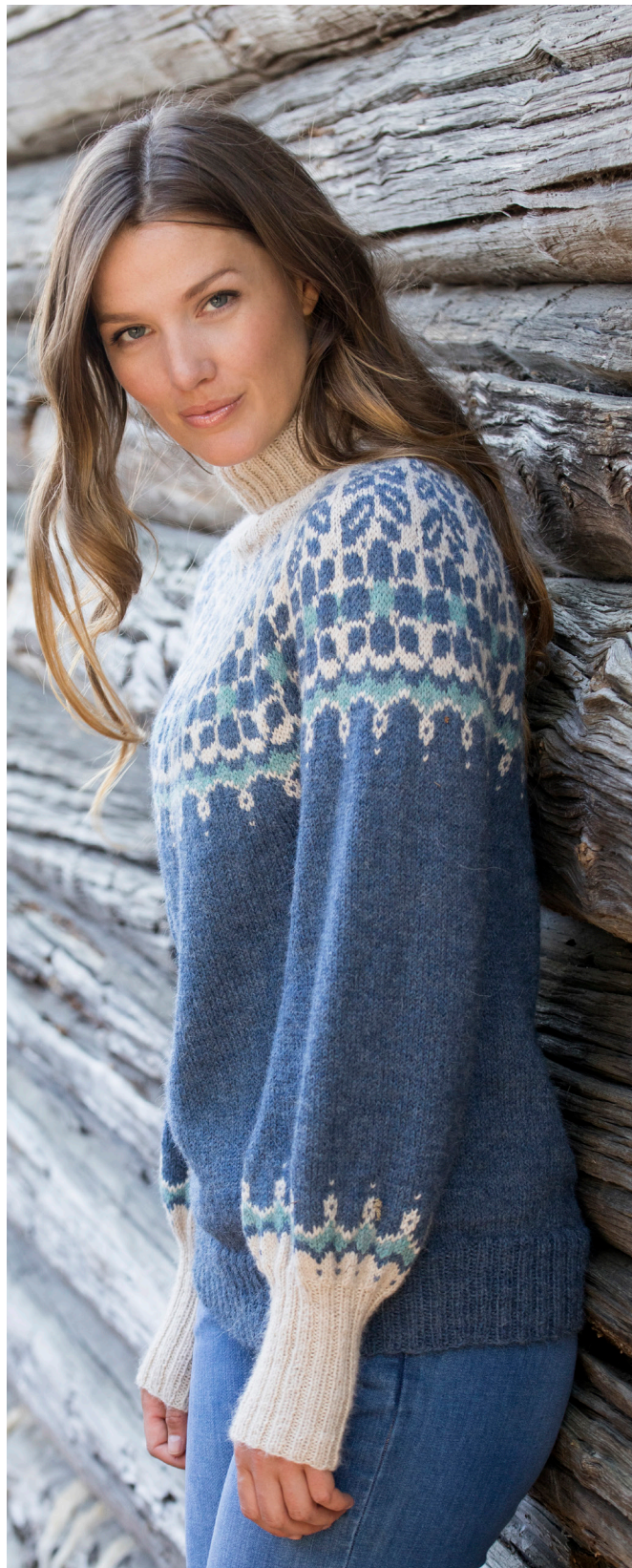
STYLIST: JAN GUNNAR SVENSON @STYLESVENSON | DESIGN AND LAYOUT: HOUSE OF YARN

The copying and publication of materials and patterns, or their use for commercial purposes, is not allowed without prior agreement with House of Yarn AS.