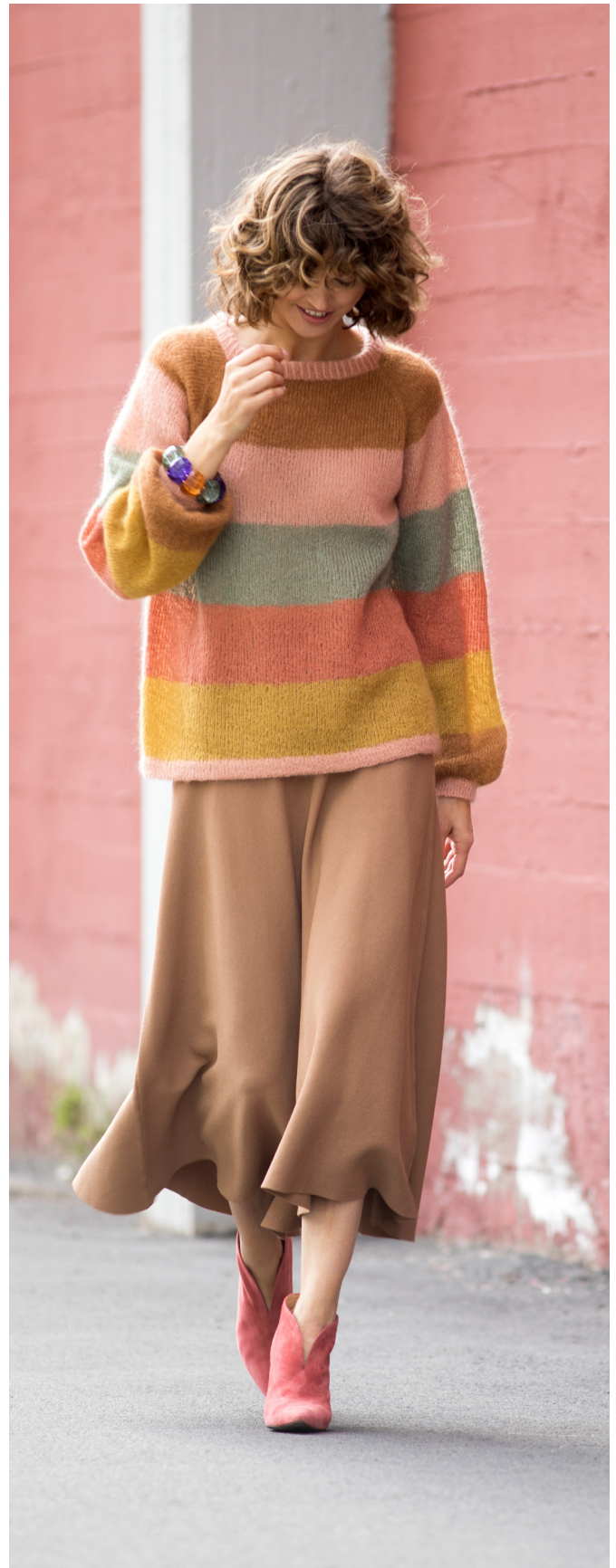
PHOTO: WENCHE HOEL-KNAI @PHOTOWENCHE | STYLIST: JAN GUNNAR SVENSON @STYLESVENSON

k = knit, p = purl, st = stitch, R = round/row, DPN = double pointed needles, k2tog = knit 2 together, m = marker, PM = place marker, tbl = through back loop, m1l = make one left, m1r = make one right, RS/WS = right/wrong side