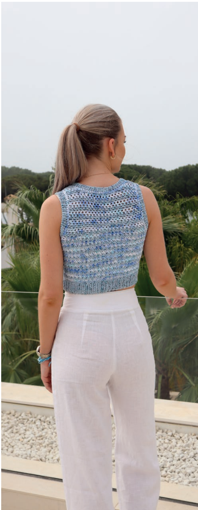
The pictured top is in a size XXS–XS