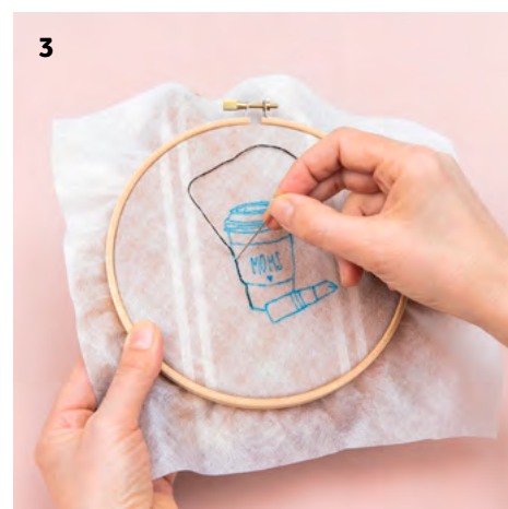
3 Mount fabric and water-soluble interlining in the embroidery hoop. Use an embroidery needle and yarn. We use two strands of yarn here. First, embroider around all the fields with black back stitch.