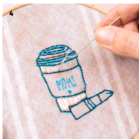
4 Fill in the fields on your design, i.e. those you want filled. Here we use satin stitch.