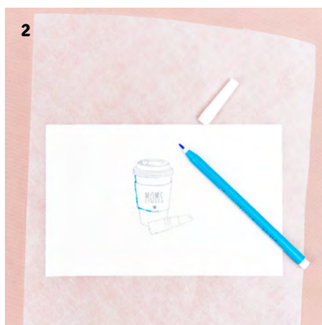
2 Place a piece of water-soluble, non-woven interlining over the template (or your design of choice). Draw up with the marker.