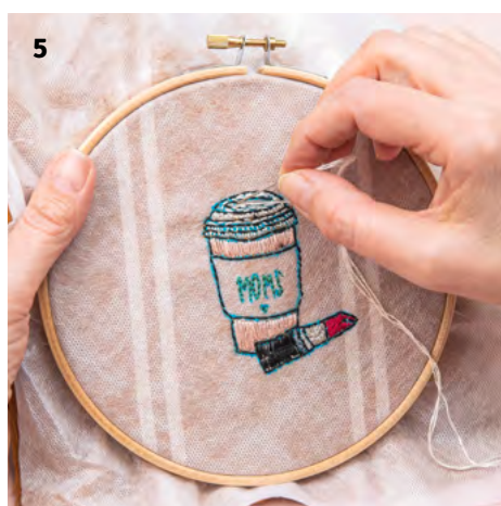
5 You can embroider some fields with basting stitch. Otherwise, use back stitch. When you have finished sewing, release your work from the embroidery hoop.