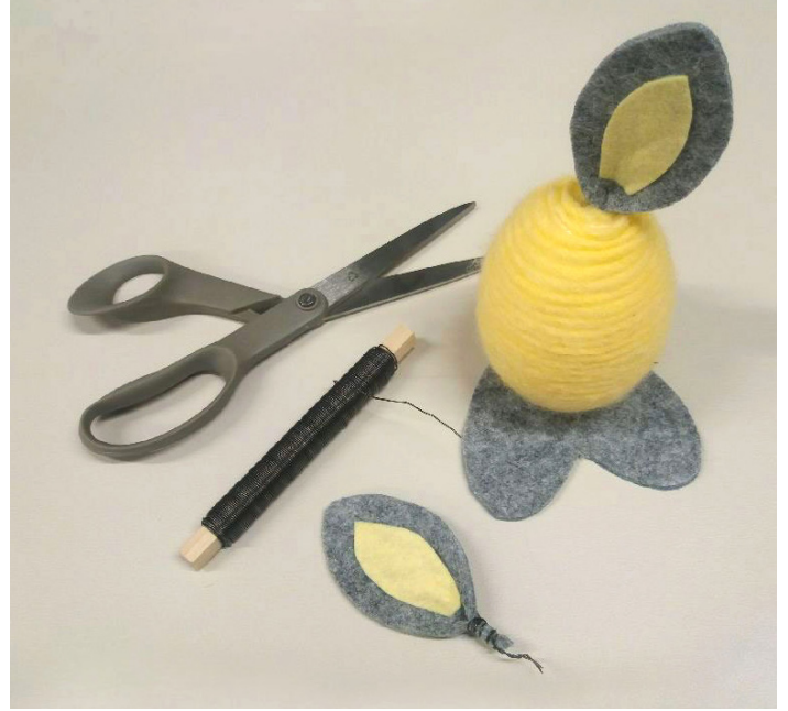
2. Cut ears and feet in thick felt and pin them to the egg.