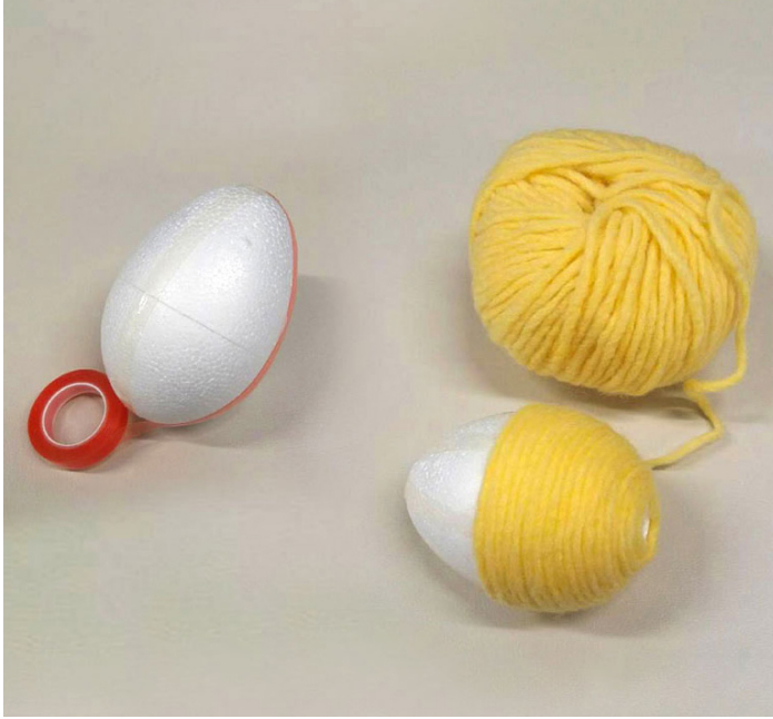
1. Wrap yellow yarn around a styrofoam egg.