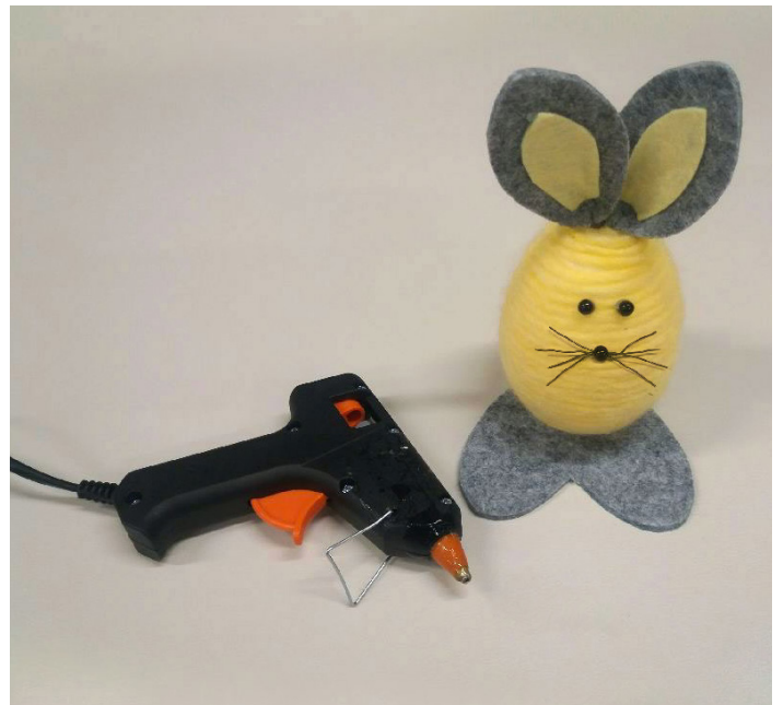
4. Cut a few strands of wire or thread and pin them to the egg, forming whiskers and nose.