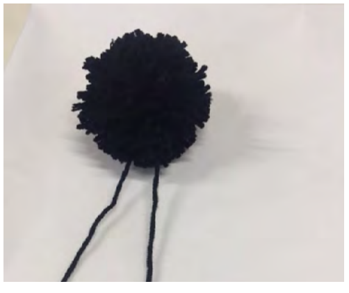
2. Make a large pompon in black yarn. Leave a long thread on the pompom.