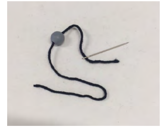
3. Tie the long thread firmly to the slit between the wings. Tie a double knot to ensure that it is securely fastened.