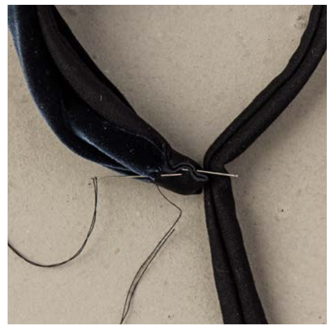
4 . Sew the grosgrain tape to the fabric at the sides and all the way around the Alice band.