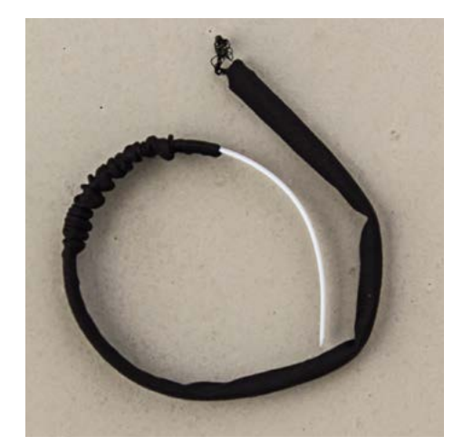
1 . Fold and sew each piece of fabric lengthwise, right sides together. Turn each piece to the right side, using a loop turner. Slide the narrow strip of stretch fabric onto the Alice band.