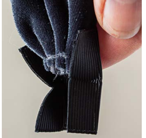
3 . Tack the ends of the inner fabric piece over the end of the Alice band to prevent it from sliding up under the outer fabric. Drape the ends of the wide piece of fabric nicely around the end of the Alice band and tack into place. Fold the grosgrain tape around the ends of the Alice band.