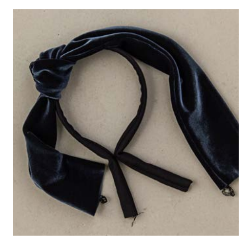
2 . Tie the other piece of fabric around the Alice band. Position the knot as you wish.