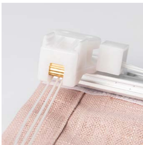
14. All the cords must run through the cord lock and out under the small steel wheel. Gather all the cords. Cut them to the same length and attach the cord lock.