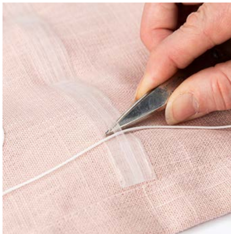
8. Cut as many cords as there are cord eyes. Each cord must measure 2 x the blind's full length + 1 x width. Thread the cords vertically up through the small loops in the blind tape.