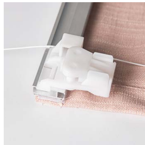
12. Attach the cord lock to the outside of the cord eye on one side - left or right, whichever is best suited to the window.