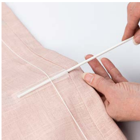
10. Insert the blind rods under the blind tapes.