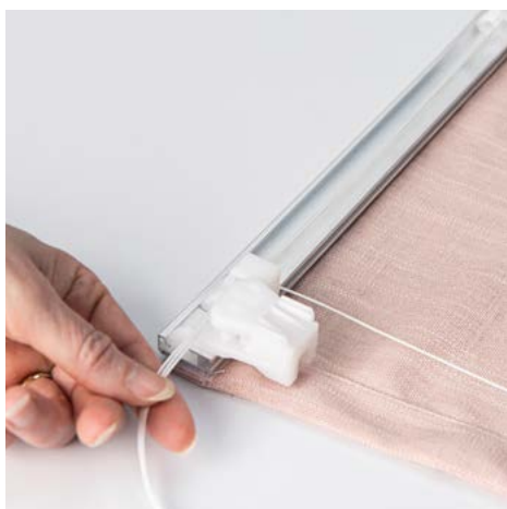
13. Then pull the cord through the cord eyes and out through the cord lock on the right/left side.