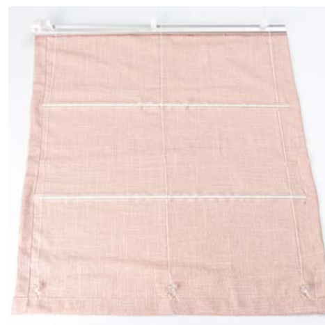
15. Attach the curtain to the rod, with the hook & loop tapes engaged.