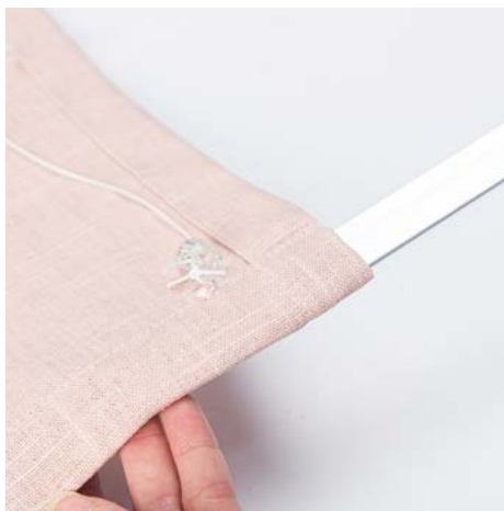
11. Insert the bottom rod into the slot, and hand-stitch to close the open end.