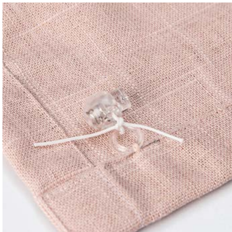
7. Tie the cord stops to the ring.