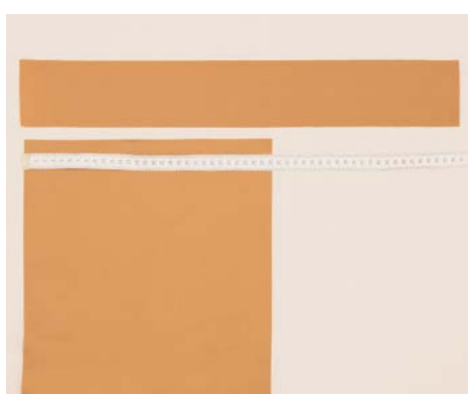
1. Size/length of the ruffle: Measure the length of the edge onto which you wish to sew the ruffle. Multiply by 1.75. E.g. the edge measures 30 cm: 30 \times 1.75 = 52.5 cm.

By the way... You can sew ruffles onto cushions, blankets, blouses, dresses anything you like!