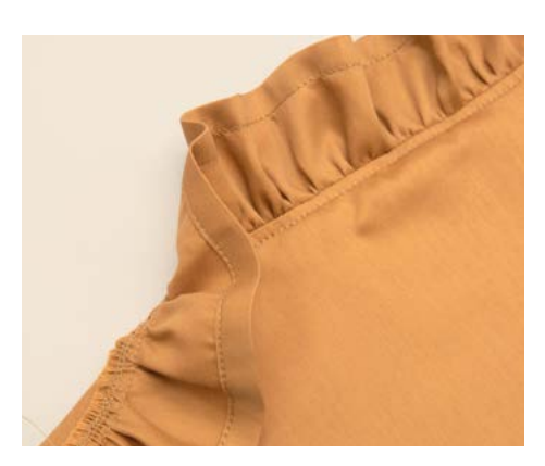
4. Press the seam allowance away from the ruffle and edge stitch from the right side to keep the seam allowance flat.