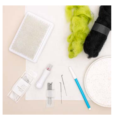
1. Make sure you have all the materials you need.