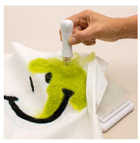
4. Repeat with the next colour. You will need to felt several layers to fill in all the spaces. Check your progress on the right side under way. As needles can break, it's good to have extra needles at hand.

3. Tear off small tufts of carded wool. Place these inside the marker lines. Place the needle felting brush beneath the fabric. Bring the felting needle holder with 7 needles up and down through the wool and fabric. Stretch out the wool before raising and lowering the needles when you reach a marked line Hint: You can mix two colours of wool. Blend small tufts and work them together.