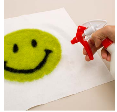
5. To remove the marker lines, spray with water from an atomiser bottle. We do not recommend that you wash needle felting projects.