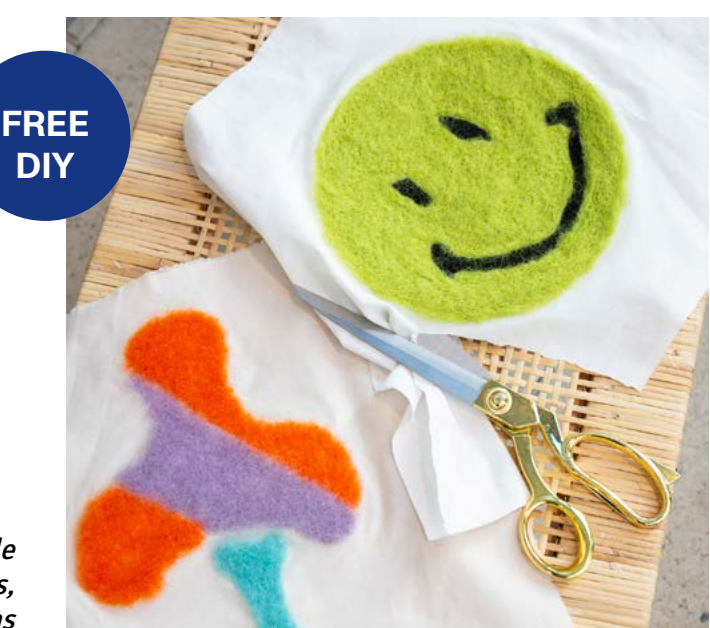
By the way... You can make needle felting motifs in all kinds of shapes, colours and patterns