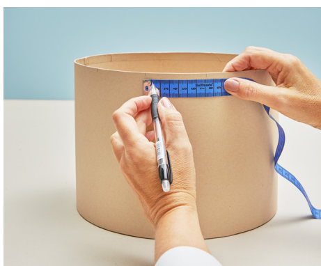
2. Measure the circumference of your box and mark an even number of stripes (you decide on their width).