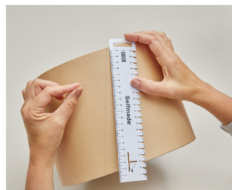
3. For best results, scratch your stripes with a needle and use our plastic seam gauge.