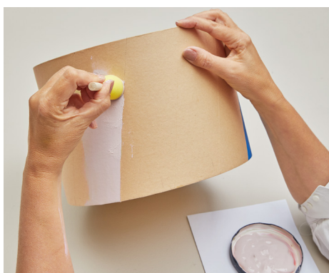
5. Then use our acrylic paint to make decorative stripes. Use a foam brush. Leave to dry and add a second layer for full coverage.