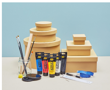
1. How to make stripes.