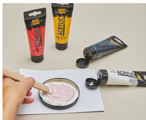
4. You can mix all kinds of colours from only five basis colours.