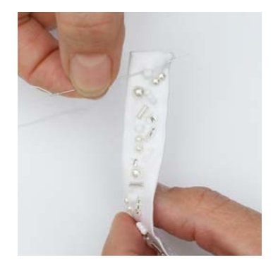
5. When you have finished or need more thread, pass the needle 2-3 times through the last bead and make one long stitch.