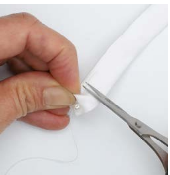
3. Pull the thread tight. Trim the thread.