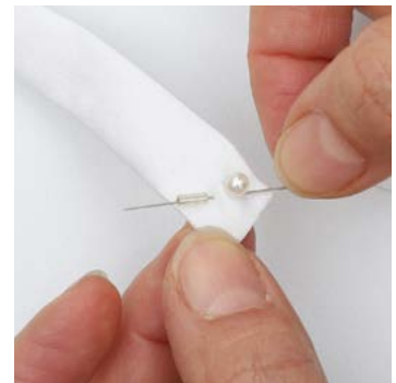
4. To make sure your sewing is invisible and each bead is secure, always sew "on the spot" (i.e. return to where you pierced the fabric). To secure a large bead, pass the needle 2-3 times through the bead. Thread the next bead onto the needle. Sew securely and return to the spot. You can sew very small beads on 2-3 beads at a time. Continue. Design your own pattern.