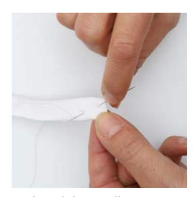
1. Thread the needle. Sew one long stitch. Pierce the fabric where you wish to place the first bead.