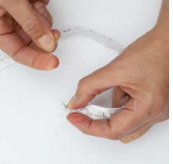
6. Pull the thread tight.