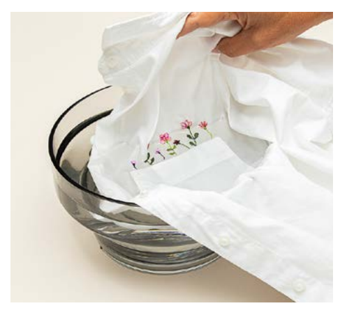
6. Rinse the fabric/garment in cold water. The interfacing and marking lines disappear, leaving behind only the embroidered motif.