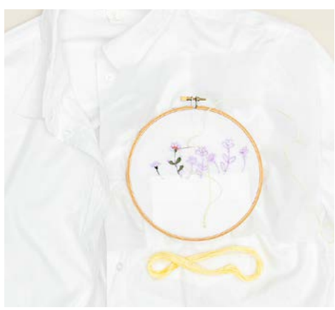
3A. Lay the interlining over the fabric. Smooth the fabric and interlining and secure in an embroidery hoop. Embroider your motif.