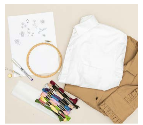
1. Make sure you have everything you need. Draw or print your motif. If you wish, copy the flowers on the following page.