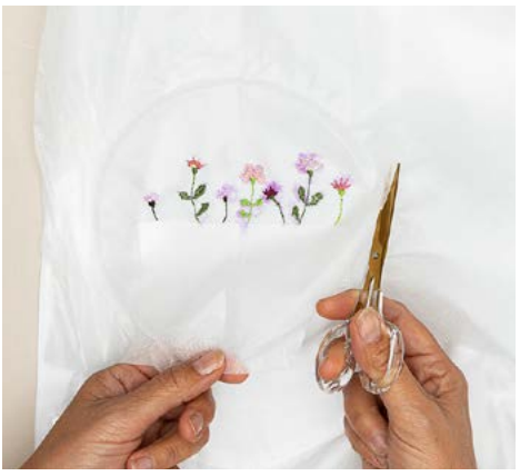
5. Cut off any excess interlining.