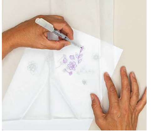
2. Lay water-soluble interfacing on top of your motif and trace. If you wish, you can repeat the motif several times.