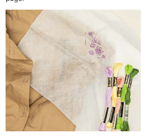
3B. If you wish to embroider a part of the garment that does not fit inside an embroidery hoop, secure the interlining with pins.